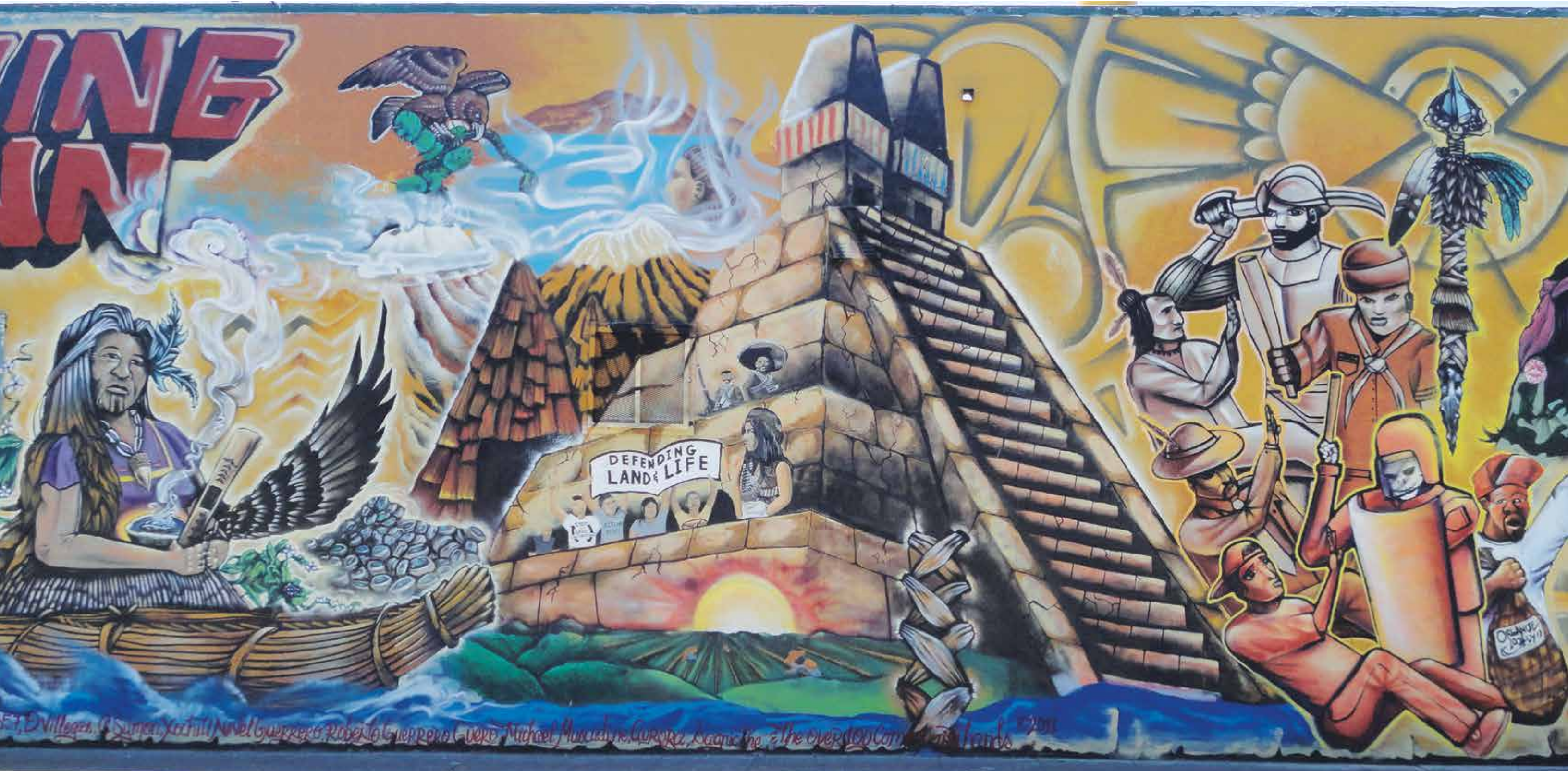
"Growing Our Roots Proclaiming Our Fruitvale," 2011